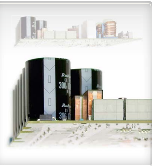
Typical THT assembly